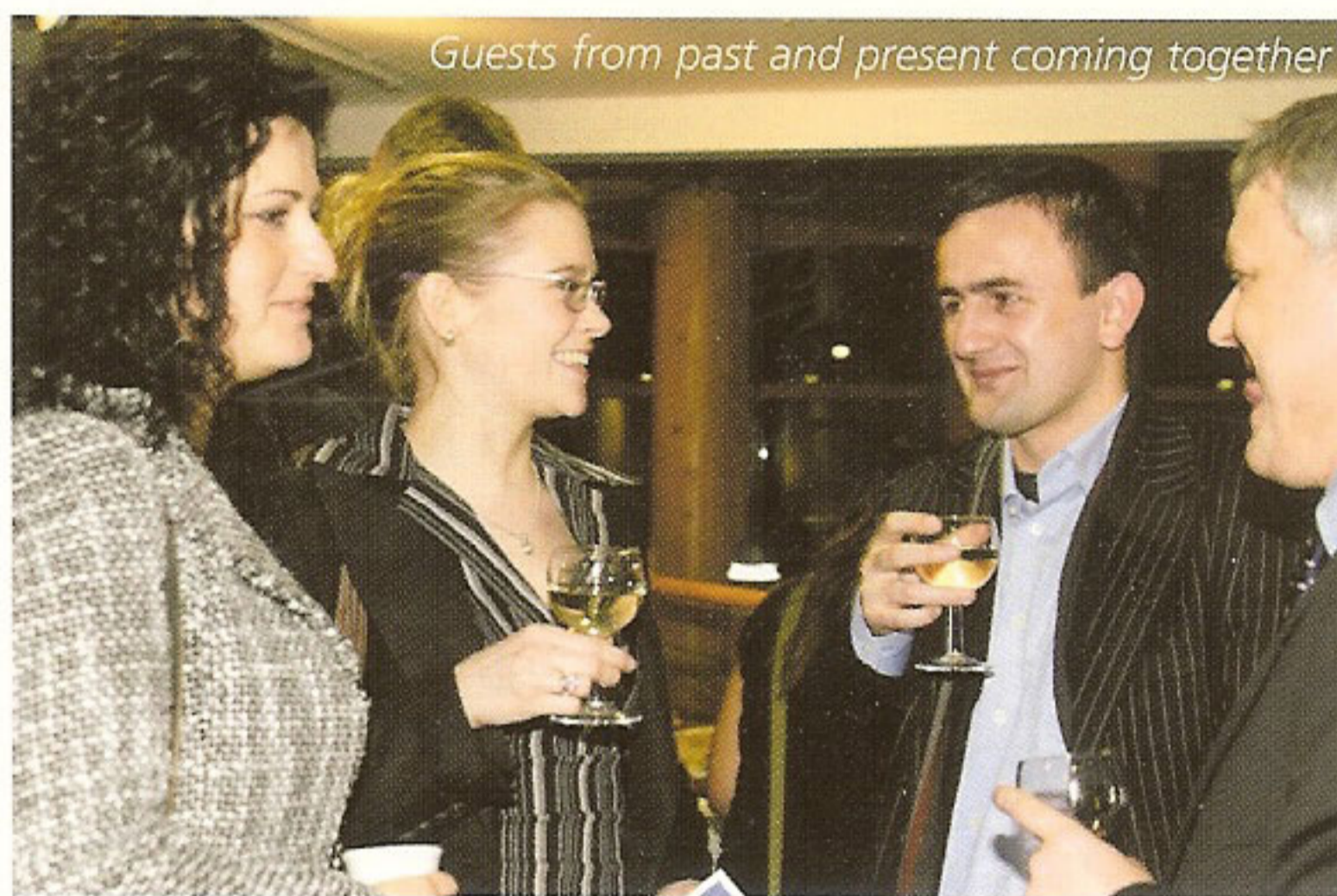
Guests from past and present coming together

Over 200 guests attended the evening event including current and former staff and students, members of the South London Law Society and visiting professors.