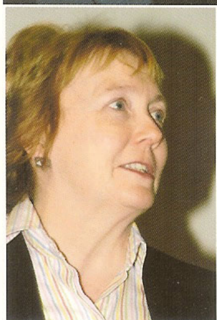
Bridget Prentice, Minister for Legal Aid

ON TUESDAY 14 MARCH in the Keyworth Centre the Law Department celebrated 30 years of its LLB programme.