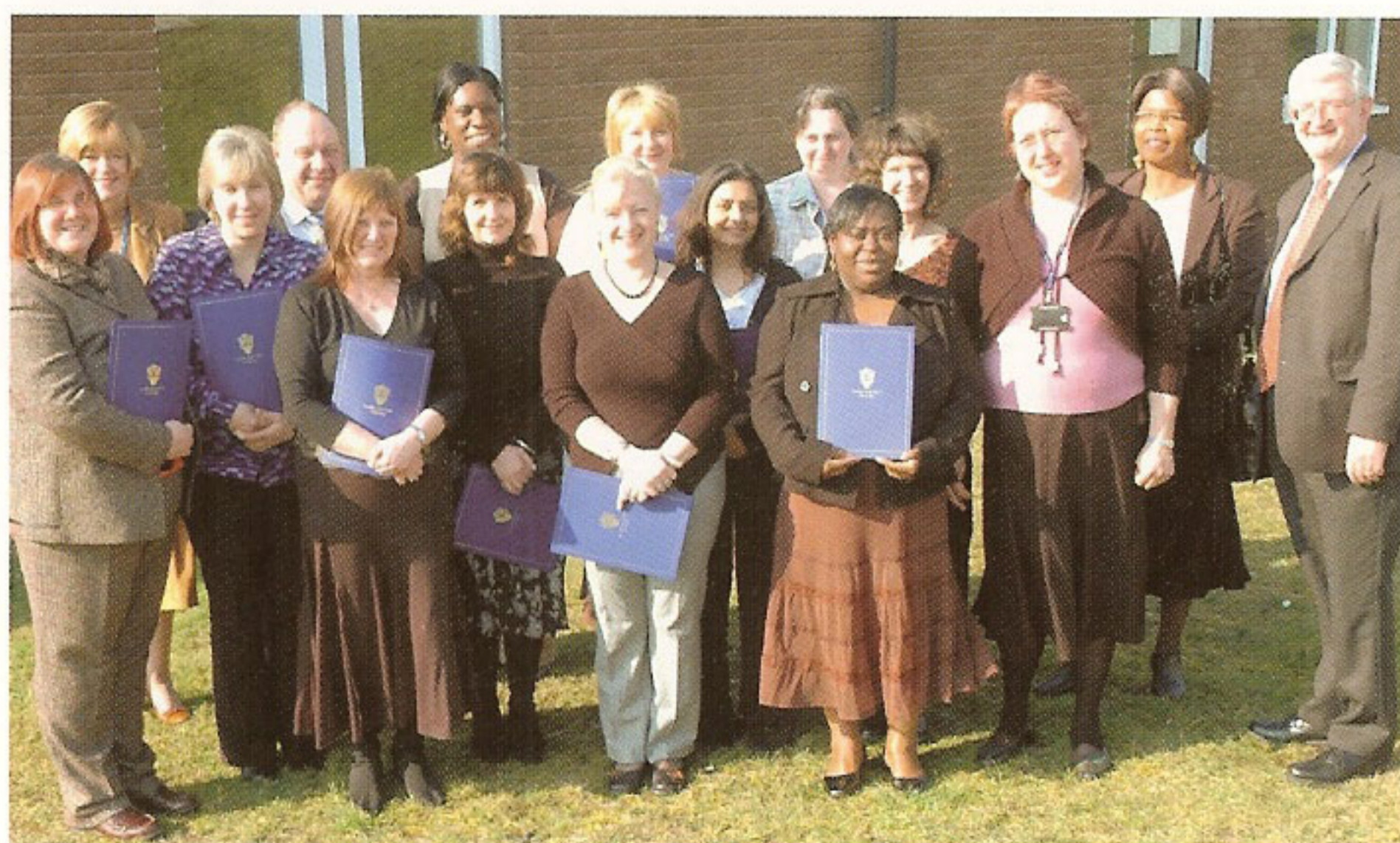
Proud to be the first recipients of the Level 4 Higher Professional Diploma in Health and Well-being

STUDENTS UNDERTAKING THE FOUNDATION Degree in Health and Social Care, at LSBU's Essex campus, were the first in the country to be awarded the City and Guilds of London Institute's Level 4 Higher